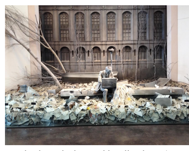
were back on the bus and heading home!