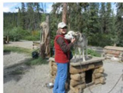
I am with a member of the Denali Dog Sled Team!