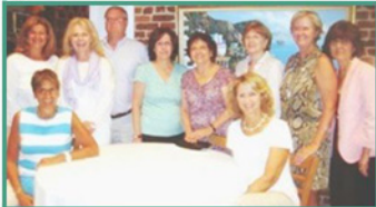
Ten of our newest retirees joined us for the PWRE Breakfast on September 4th.

The "We Don't Have to Go Back to School Breakfast" is a wonderful way to welcome our new retirees and to "touch base" with our colleagues who have already been enjoying their well-deserved retirement.