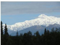
Denali (Mt. McKinley)

miles when we rounded a corner and there she was in all her glorious majesty, Denali, or her American name, Mt. McKinley, the highest peak in North America, seen only by about 30% of visitors to Alaska. One young man studying fault lines in Alaska since May told us he hadn't seen the mountain until this morning. We felt honored and elated at our luck. We stopped at every opportunity for a different vantage point to take photos. The breakfast stop for the caravan was at a lodge that featured one of the best view spots on the road. This was a special day with a visual memory of that mountain that pictures can't quite capture.