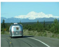
"HOMER" The Reed "AIRSTREAM"