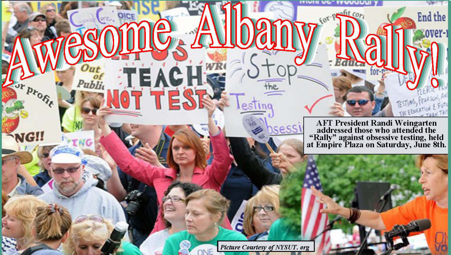
AFT President Randi Weingarten addressed those who attended the "Rally" against obsessive testing, held at Empire Plaza on Saturday, June 8th.

NYSUT NO. 19 030R Visit our website at: www.pwta.us/PWRE AFT NO. 9591-R