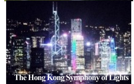
The Hong Kong Symphony of Lights