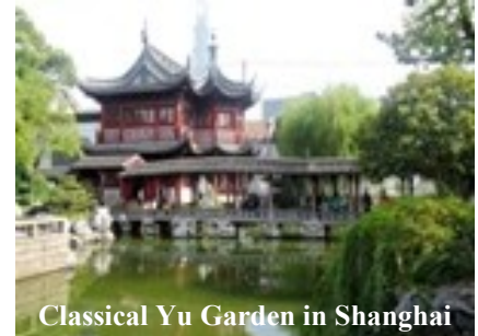
Classical Yu Garden in Shanghai

We recently returned from almost three weeks in China and it was a very active trip full of exciting experiences. We hiked up the Great Wall of China in Beijing, marveled at the Terra Cotta Warriors in Xi'an, fell in love with the Giant Pandas in Chongqing, enjoyed a cruise down the Yangtze River, gaped at the skyscrapers along the Bund in Shanghai, and were dazzled by cosmopolitan Hong Kong. Our guides told us, "image is everything" in China, but they showed/shared with us a great deal more about their country, both the good and the bad.