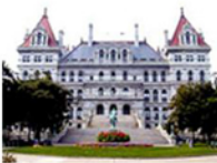
NYS Capital in Albany