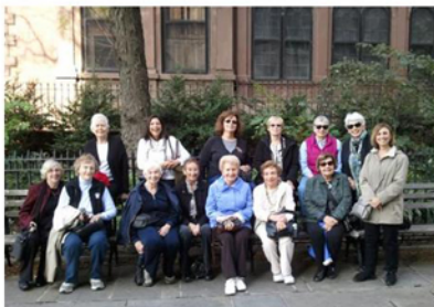
The fourteen walkers take a welcome rest after walking around in Brooklyn Heights.