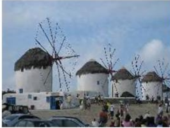
The windmills of Mykonos