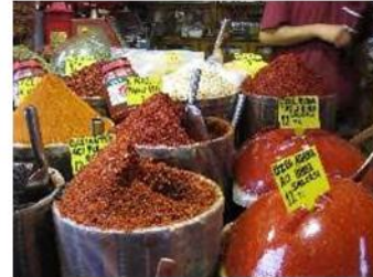
The Spice Market