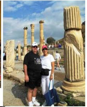
Visiting Ephesus in Turkey